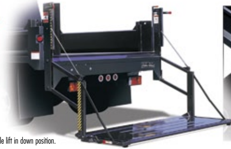
Double Eagle cable lift in down position.