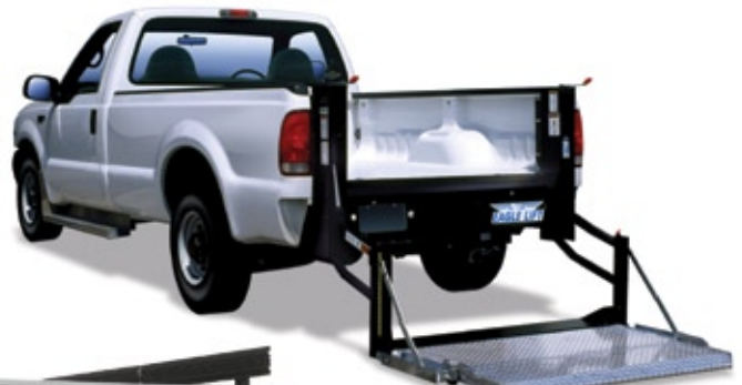
Direct Lift for Standard Pickups