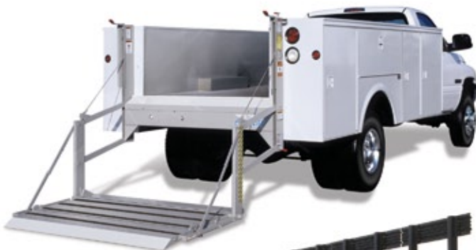
Cable Lift for Service and Utility Bodies