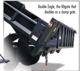
Double Eagle, the liftgate that doubles as a dump gate.