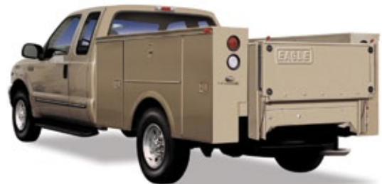
Direct Lift for Service Bodies