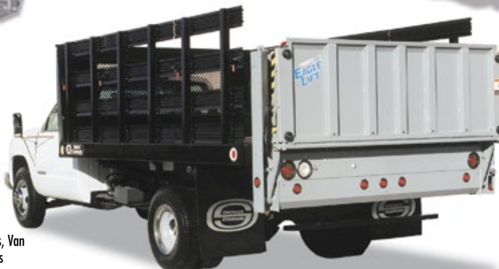
Direct Lift for Stake Bodies, Van Bodies and Tire Bodies