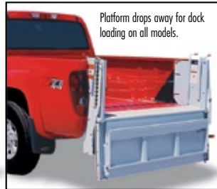
Platform drops away for dock loading on all models.